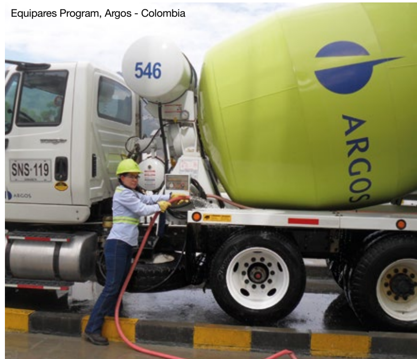
Equipares Program, Argos - Colombia