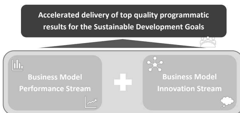
Figure 2. Accelerated delivery of top-quality programmatic results for the Sustainable Development Goals

66. UNDP country offices are the programmatic and operational backbone of the organization and will be central to the two streams of work, as well as key beneficiaries of the outcomes. The improved business model will empower country offices to deliver the services requested of them within their diverse operating contexts, in a manner that is financially sustainable.