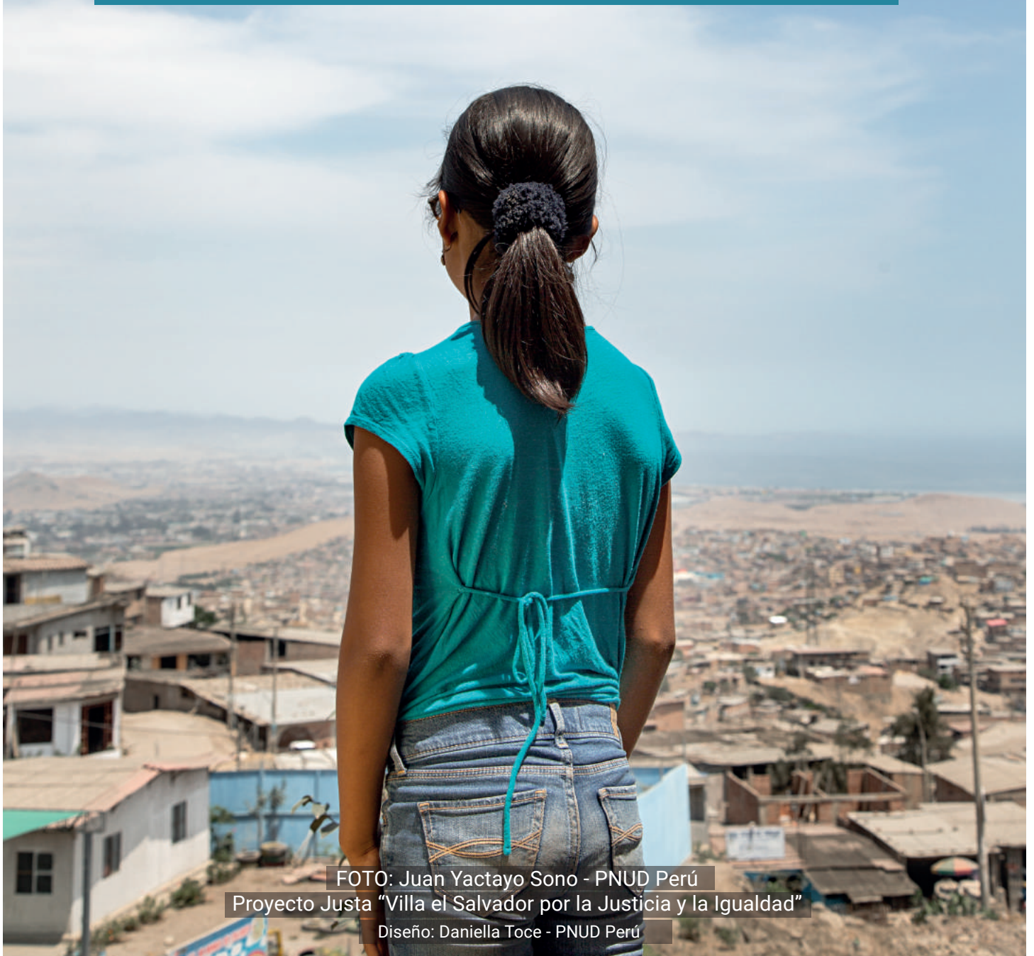
Proyecto Justa "Villa el Salvador por la Justicia y la Igualdad"

When a woman is a victim of violence, the negative impacts are not only felt by her alone. This problem is an obstacle in the way of the social and economic development of their families, their communities and society as a whole. This report, done for the first time in Peru, gathers data at a district level to quantify the costs of violence and showcases why violence prevention measures based on the rights of women and girls are vital to eradicate this problem and strengthen the leadership role they play in their own lives.